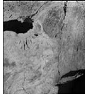
Figure-2: Satellite Image

data in to groups and map these new data. The clustering algorithm which provides improvement to the support vector machine is support vector clustering.