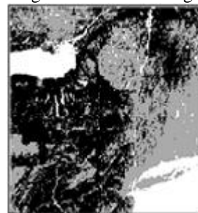
Figure-4: Gabor Filter Method