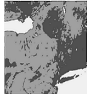
Figure-3: GLCM Method